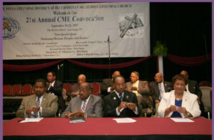
Bishops and the Missionary Supervisor at the Annual Christian Methodist Episcopal Convocation taking an HIV Antibody Test